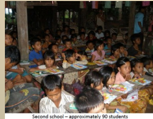
Second school – approximately 90 students